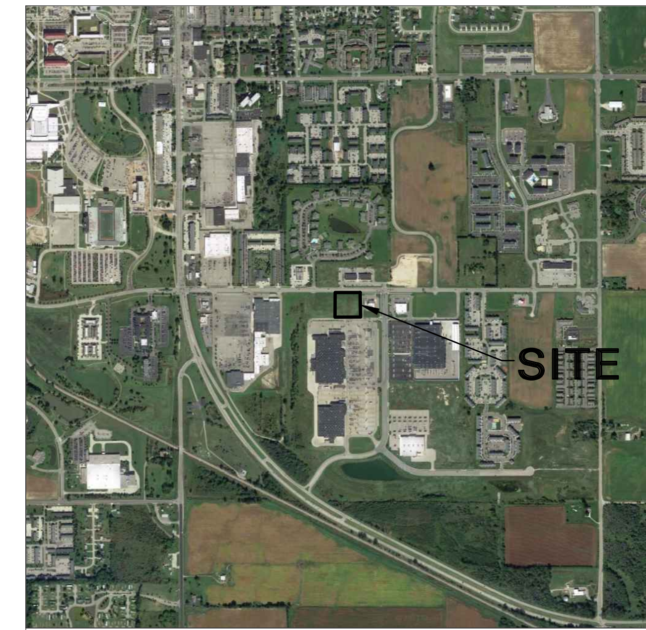
LOCATION MAP (N.T.S)